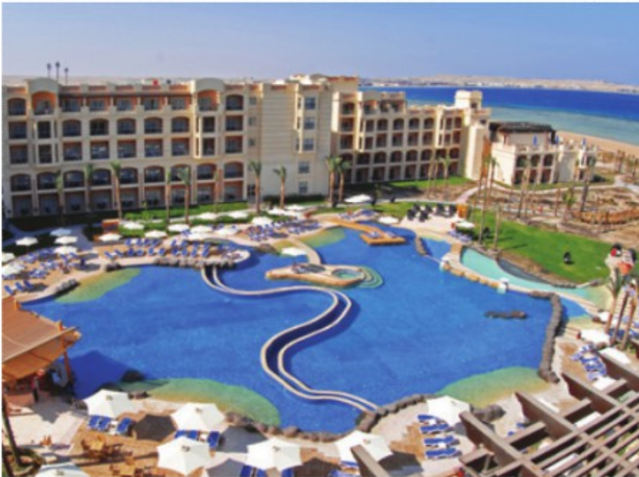
TROPITEL SAHL HASHEESH