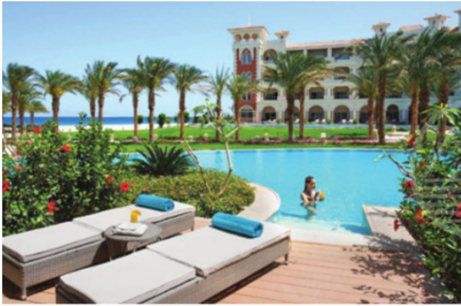
BARON PALACE RESORT SAHL HASHEESH