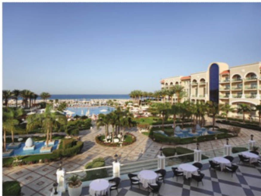
PREMIERE LE REVE